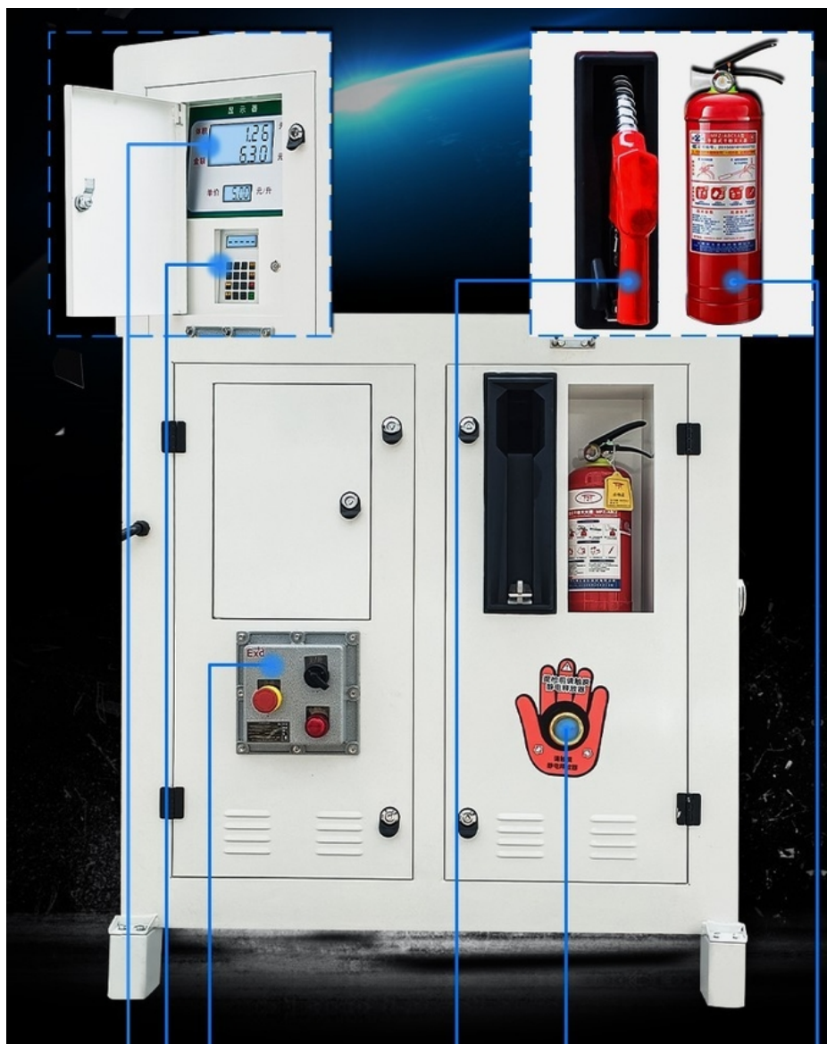
Explosion-proof switch box